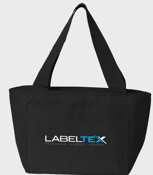
00040 Recycled Cooler Bag Colors: Various