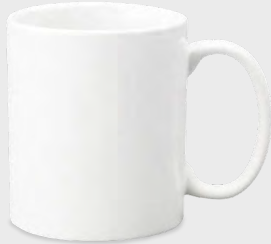
00017 11oz Ceramic Mug Colors: White