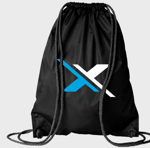
00035 Drawstring Bag Colors: Various