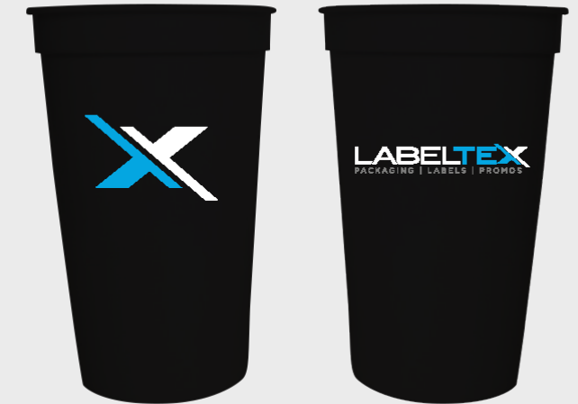
00064 Stadium Cup Colors: Various