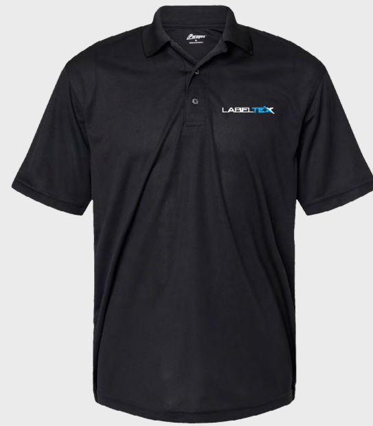
00002 Mini Mesh Polo Colors: Various