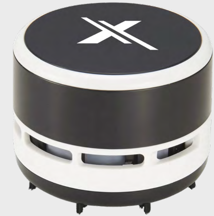
00052 Mini Desk Vacuum Colors: Black