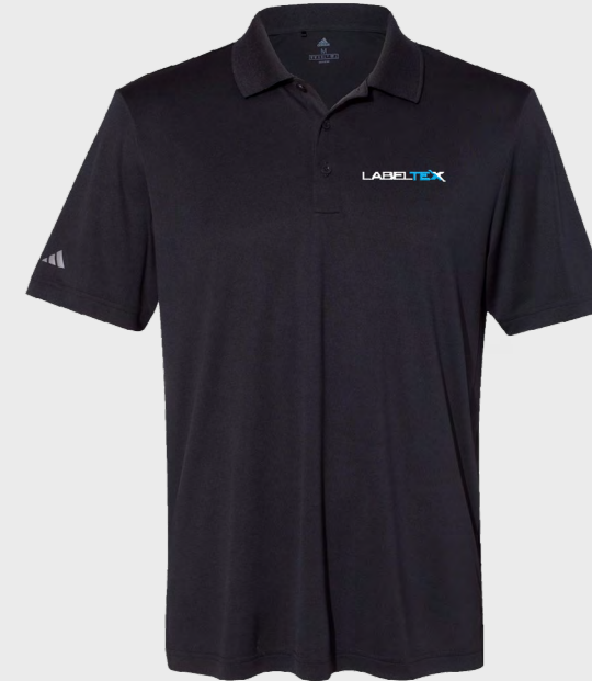
00003 Performance Polo Colors: Various