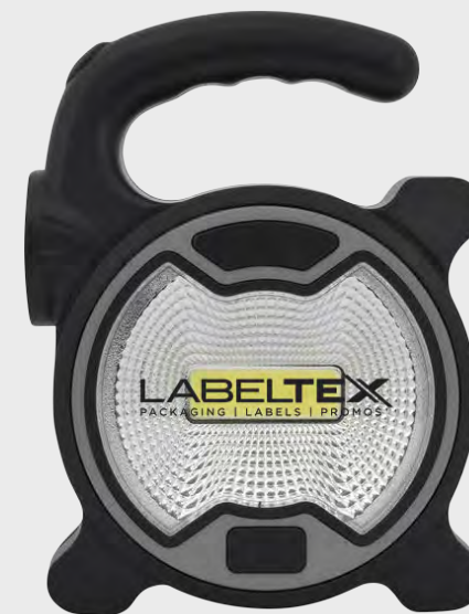
00047 2-in-1 LED Carry Light Colors: Various