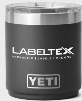
00065 Rambler 10oz Lowball Colors: White/Navy/Black/Stainless