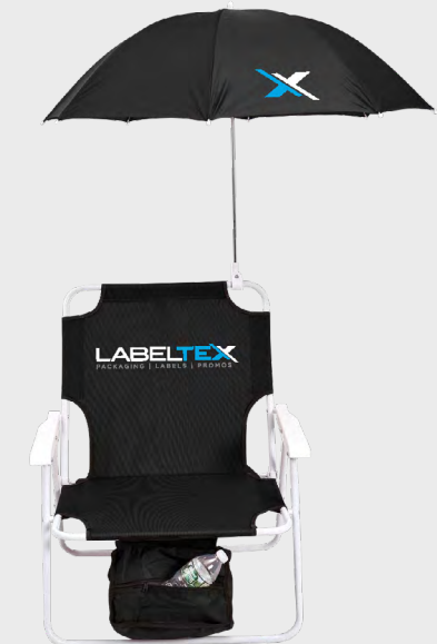
00072 Jones Beach Combo Chair Colors: Black/Navy/Red