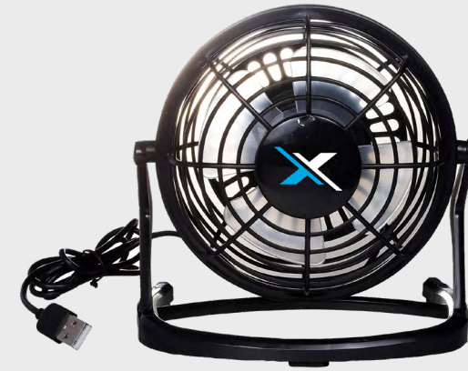
00051 USB Powered Desk Fan Colors: Black/White