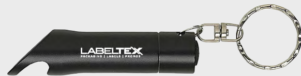
00045 Key Light w/ Bottle Opener Colors: Black/Red