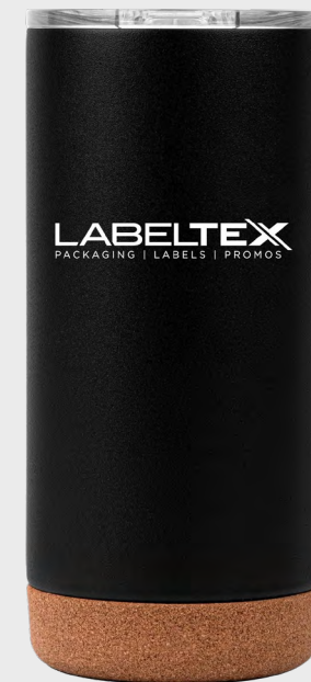
00023 18oz Cork Bottom Mug Colors: Black/Navy/White