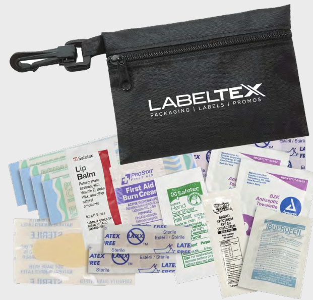
00062 Ripstop Deluxe Kit Colors: Various