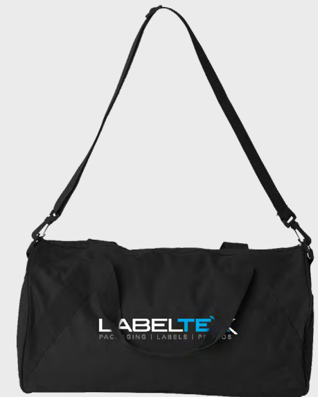
00036 18" Small Duffel Bag Colors: Various