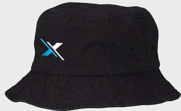
00013 Bucket Hat Colors: Various