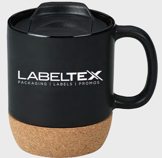
00020 12oz Cork Bottom Ceramic Mug Colors: Various