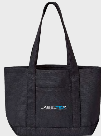
00034 Large Boater Tote Colors: Various