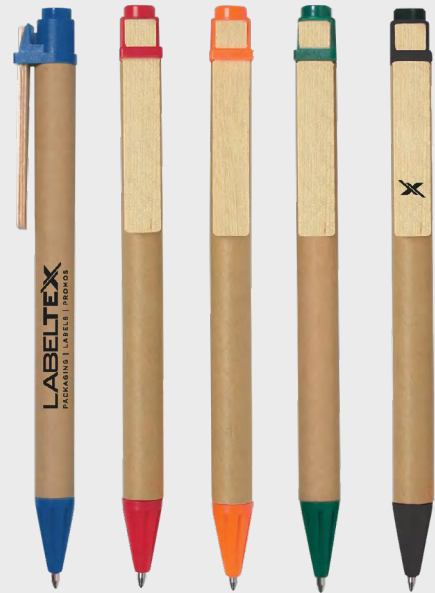
00073 Inspired Ball Pens Colors: Various