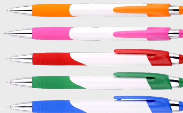
00029 Pens Colors: Various