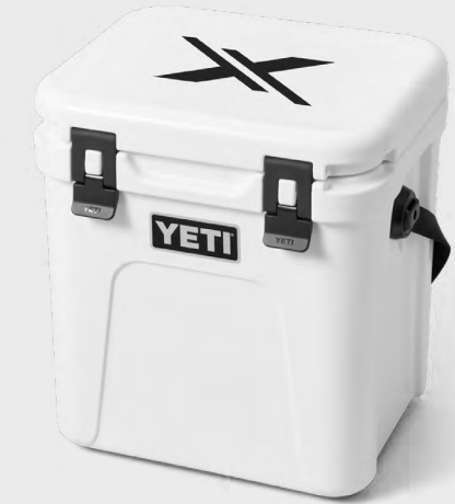
00068 Roadie Cooler Colors: White/Tan/Charcoal