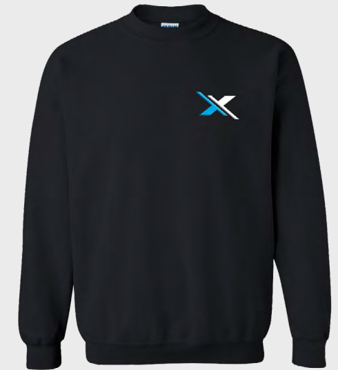
00004 Heavy Blend Crewneck Sweatshirt Colors: Various