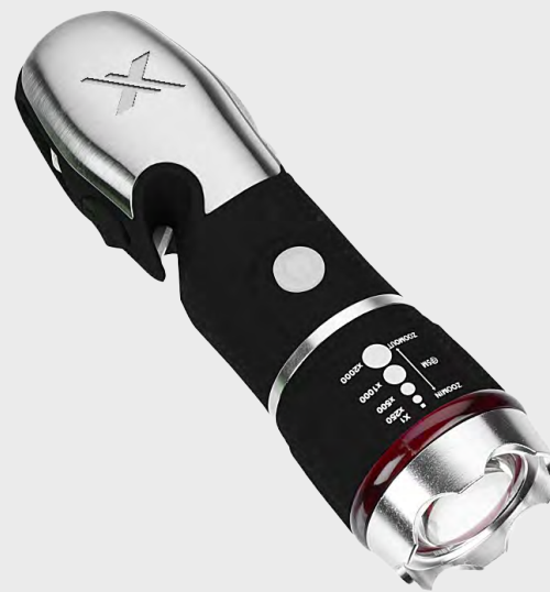
00046 Emergency Flashlight Multi-Tool Colors: Various