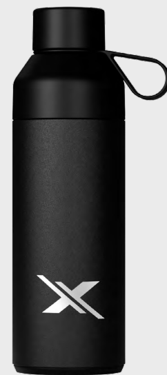
00086 OG Ocean Bottle Colors: Various