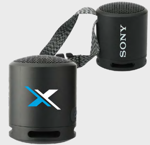
00044 Bluetooth Speaker Colors: Black