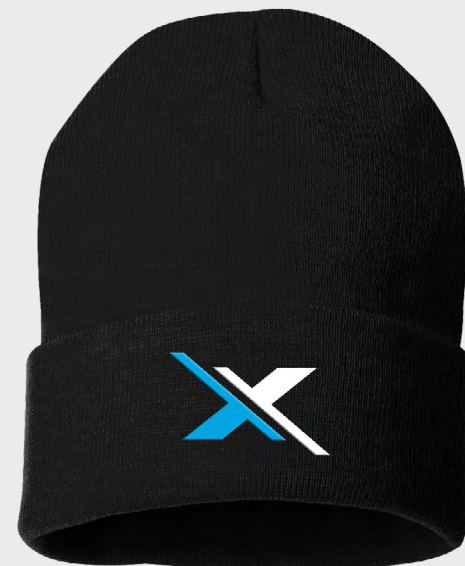
00014 Solid Cuffed Beanie Colors: Various