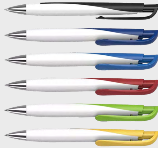
00025 Pens Colors: Various