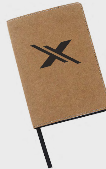
00075 Kraft Paper Journal Colors: Kraft Paper