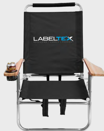
00069 Bahama Beach Chair Colors: Black/Navy/Red/Royal Blue