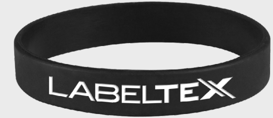
00060 Silicone Wristband Colors: Various