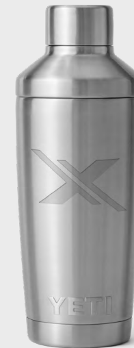
00067 Rambler Shaker Colors: White/Navy/Black/Stainless