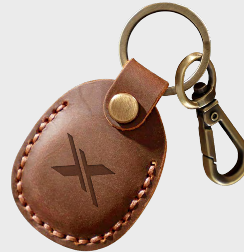
00083 Airtag Keychain Colors: Brown Leather