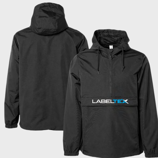
00006 Nylon Anorak Colors: Various