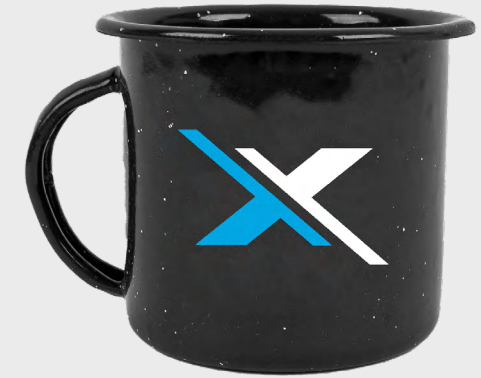
00084 Campfire Mug Colors: Various