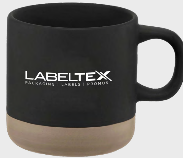
00019 12oz Clay Base Ceramic Mug Colors: Black/Grey/White