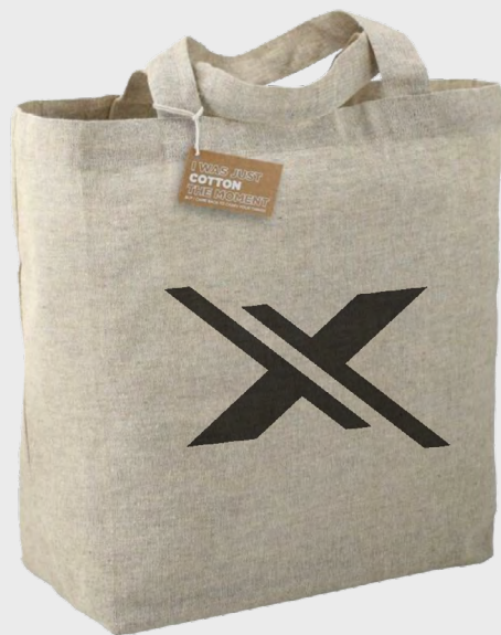
00077 Recycled Grocery Tote Colors: Natural/Blue/Green