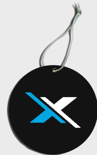
00056 Round Air Freshener Colors: Various