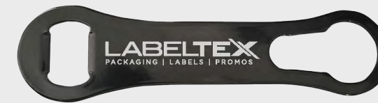
00063 Church Key Bottle Opener Colors: Various