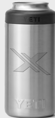
00066 Colster Colors: White/Navy/Black/Stainless