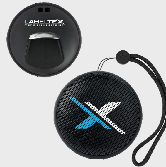
00043 Bluetooth Speaker/Bottle Opener Colors: Various