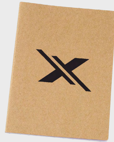
00074 Memo Notebook Colors: Various