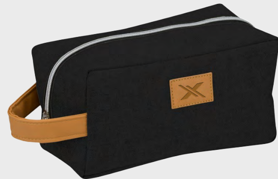
00037 Toiletry Bag Colors: Wine/Gray/Blue/Green/Black