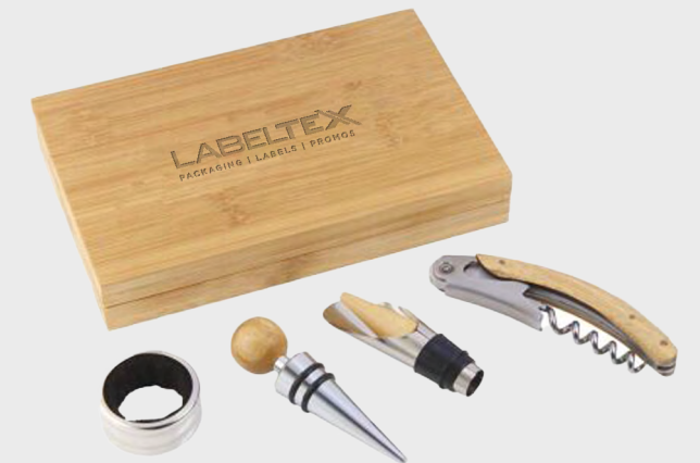
00080 Bamboo Wine Gift Set Colors: Bamboo