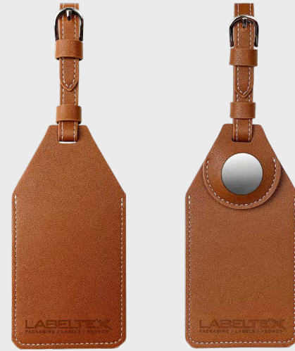
00082 Airtag Luggage Tag Colors: Brown Leather