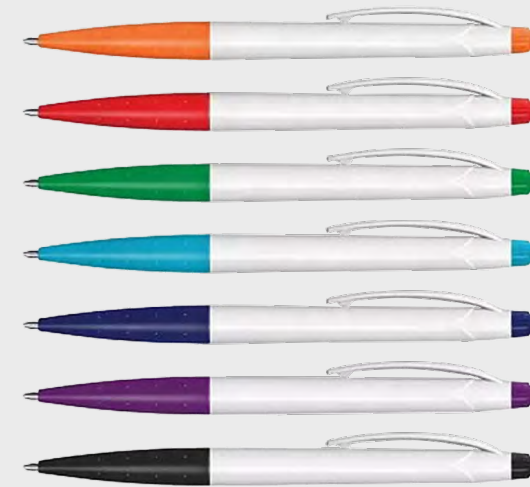
00027 Pens Colors: Various