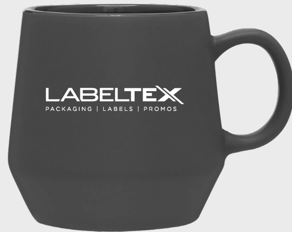
00022 16oz Ceramic Mug Colors: Matte Black