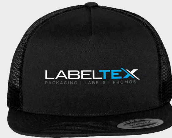
00011 Classic Trucker Hat Colors: Various