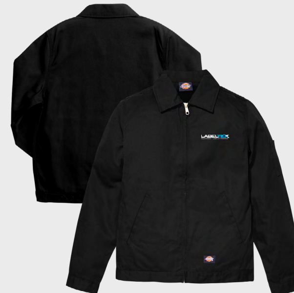
00007 Unlined Industrial Jacket Colors: Various