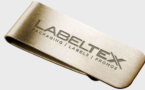
00081 Brass Money Clip Colors: Brass