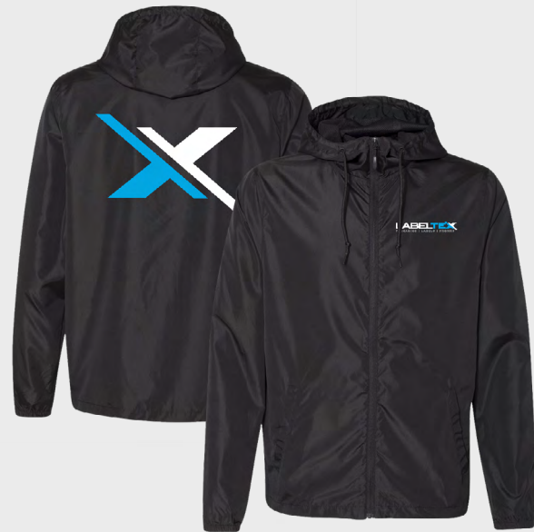
00005 Lightweight Windbreaker Colors: Various