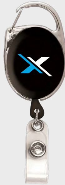
00058 Badge Reel Colors: Various