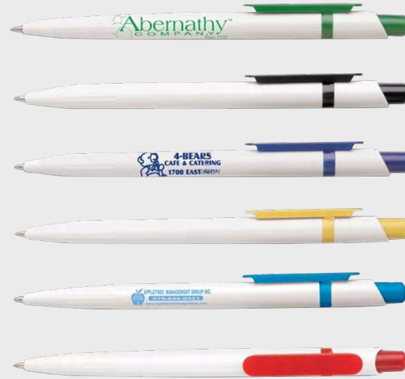
00026 Pens Colors: Various