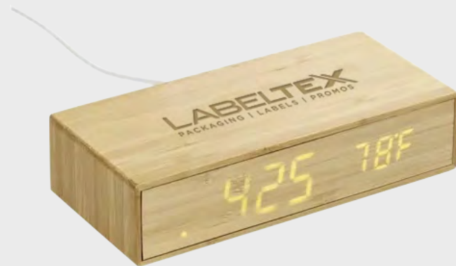
00054 Wireless Charging Desk Clock Colors: Bamboo