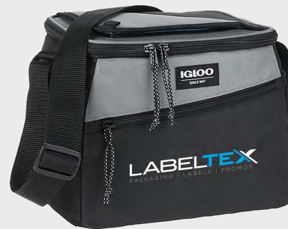
00039 Glacier Box Cooler Colors: New Navy / Deep Fog