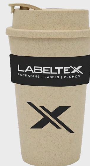
00079 16oz Wheat Tumbler Colors: Various