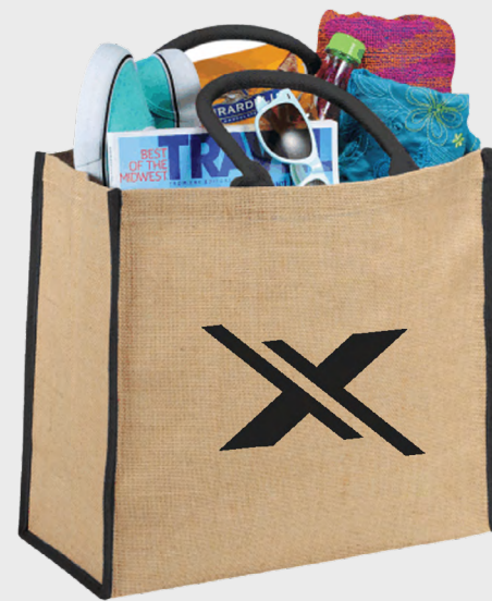
00078 Large Jute Tote Colors: Beige/Black/Navy