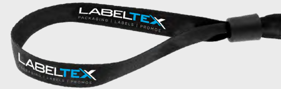
00059 Event Wristband Colors: Various