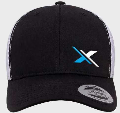
00012 Retro Trucker Colors: Various