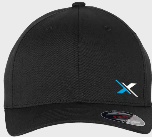
00010 Cotton Blend Cap Colors: Various