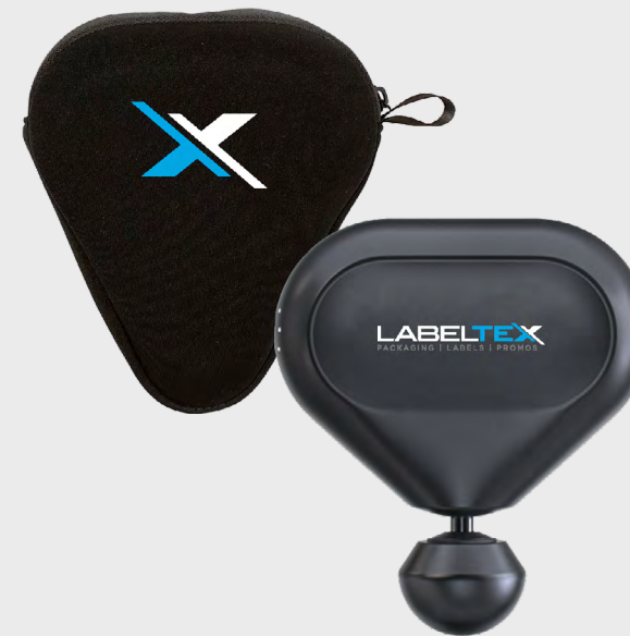
00087 Theragun Mini Colors: Black/Desert Rose/White