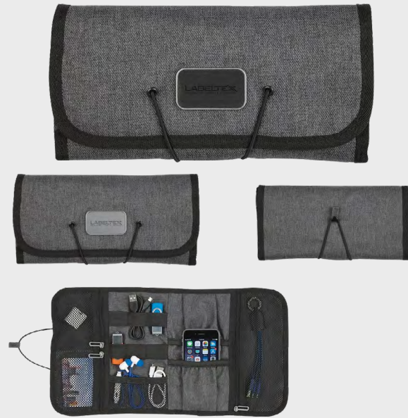
00041 Travel & Tech Organizer Colors: Gray