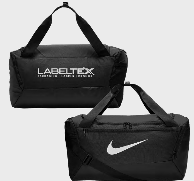
00088 Small Duffel Bag Colors: Black