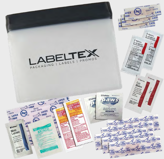
00061 Essential Care PEVA Kit Colors: Black/Blue/Red/White