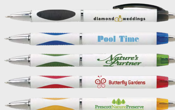
00030 Pens Colors: Various