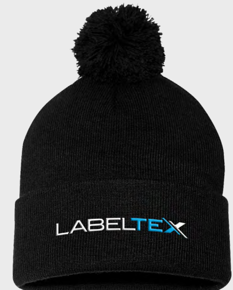
00016 Pom-Pom Cuffed Beanie Colors: Various