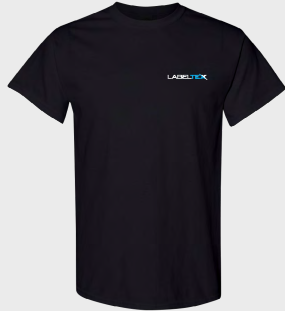
00001 Heavy Cotton Tee Colors: Various