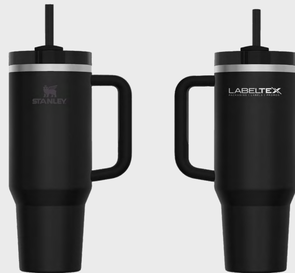
00085 The Quencher H2.0 FlowState Colors: Various