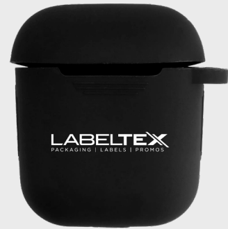
00050 Airpod Silicone Cover Colors: Various