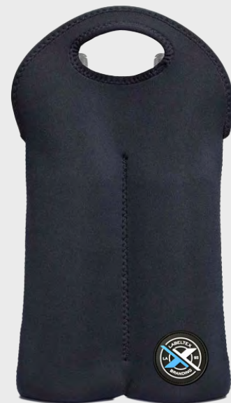
00038 Neoprene Wine Tote Colors: Black