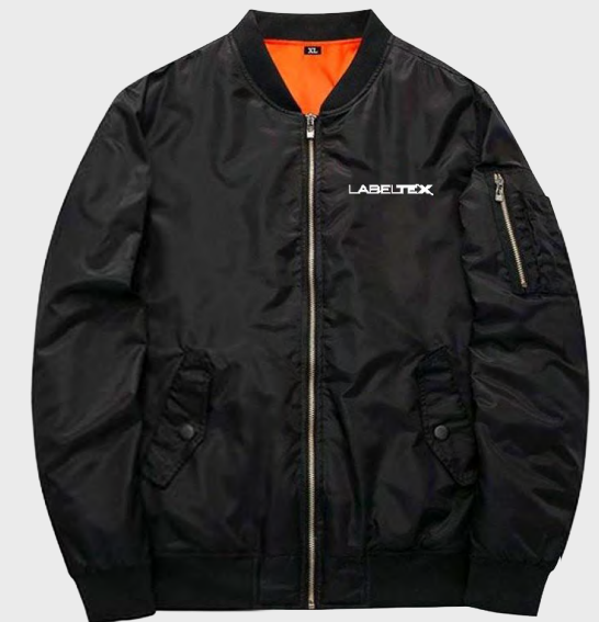
00008 Flight Bomber Jacket Colors: Various