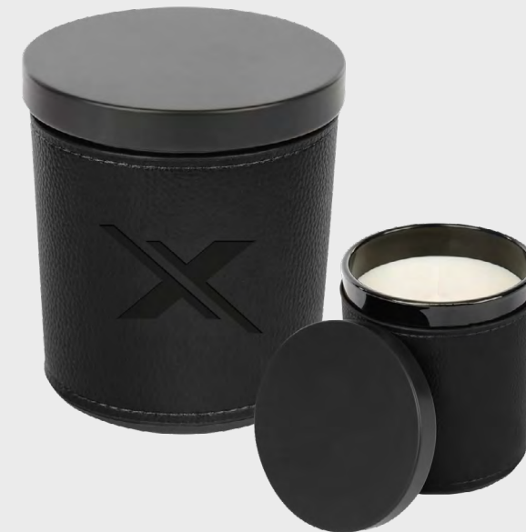
00055 Candle w/ Leatherette Sleeve Colors: Black/Brown