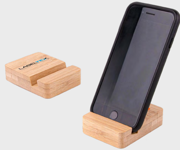
00049 Eco-Friendly Phone Holder Colors: Bamboo