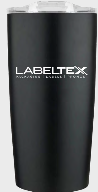
00024 20oz Stainless Steel Tumbler Colors: Various