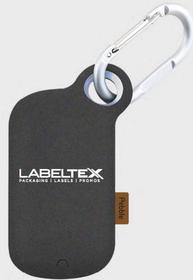
00042 Portable Charger Colors: Various