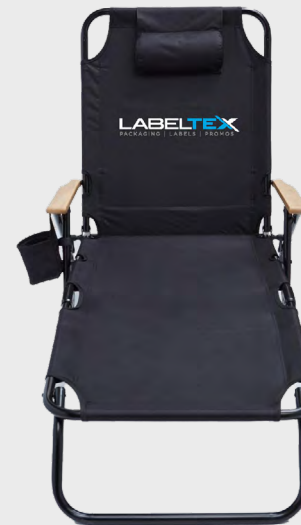
00071 South Beach Lounger Chair Colors: Black/Navy/Red