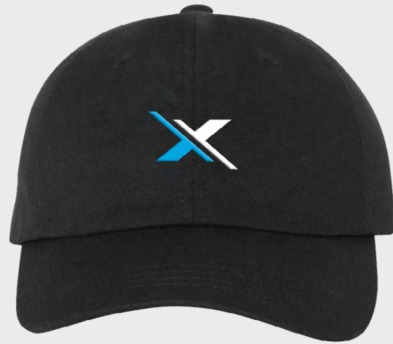
00009 Classic Dad Hat Colors: Various