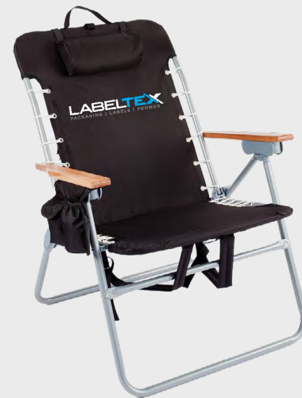
00070 Rio Grande Beach Chair Colors: Black/Navy