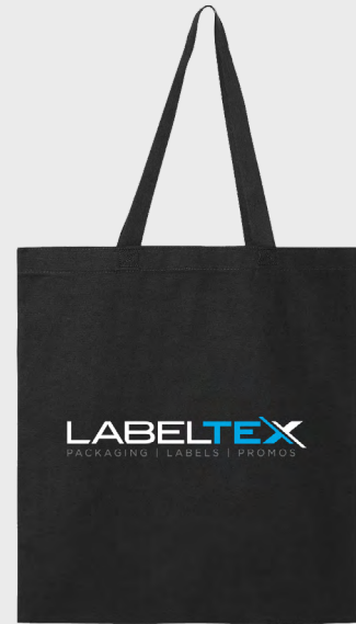
00033 Promotional Tote Colors: Various