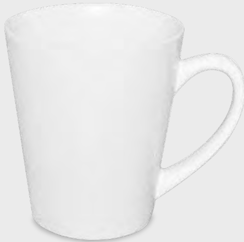
00021 14oz Grande Mug Colors: White