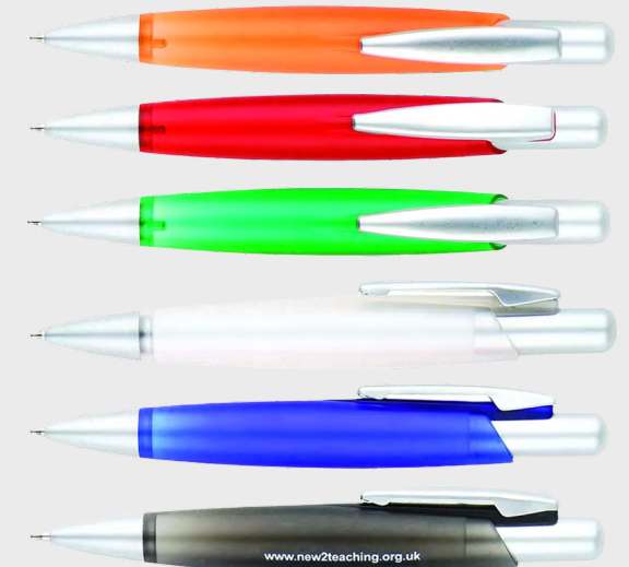
00028 Pens Colors: Various