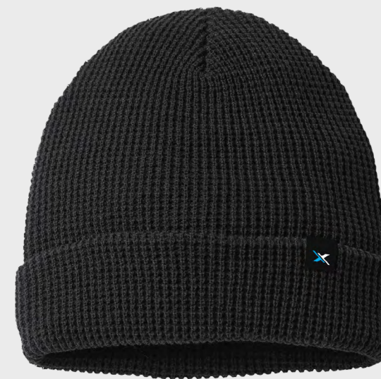
00015 Waffle Cuffed Beanie Colors: Various