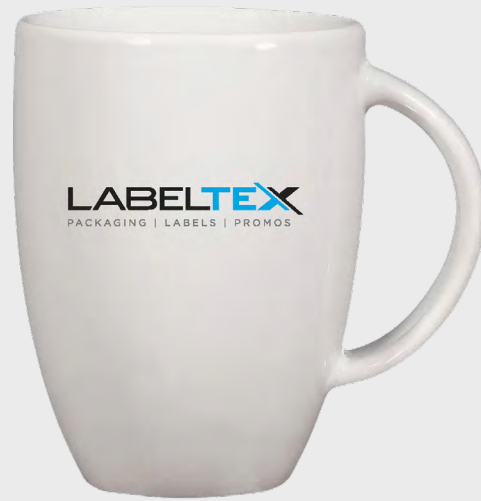
00018 12oz Ceramic Mug Colors: Various